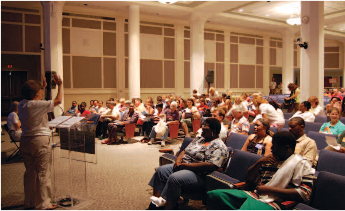
One of the pre-training orientations in City Hall