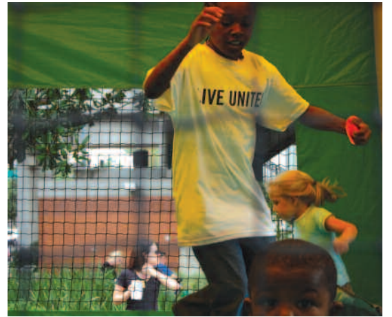
Children playing in the bouncy-house in Hemming Plaza