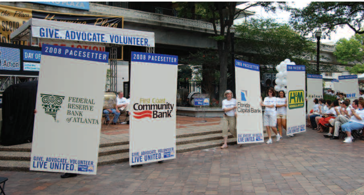
The "Pacesetter Parade" during the June 21 Day of Action