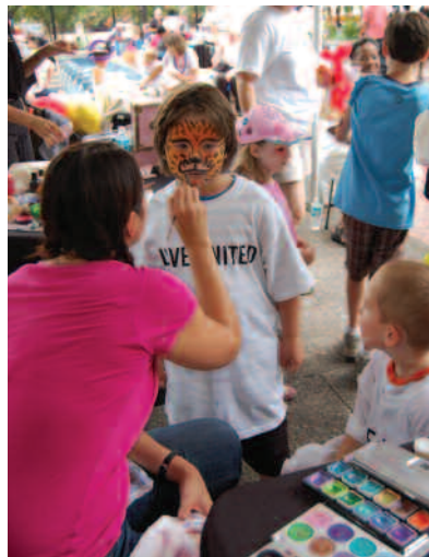
Children at the Day of Action festival getting their faces painted