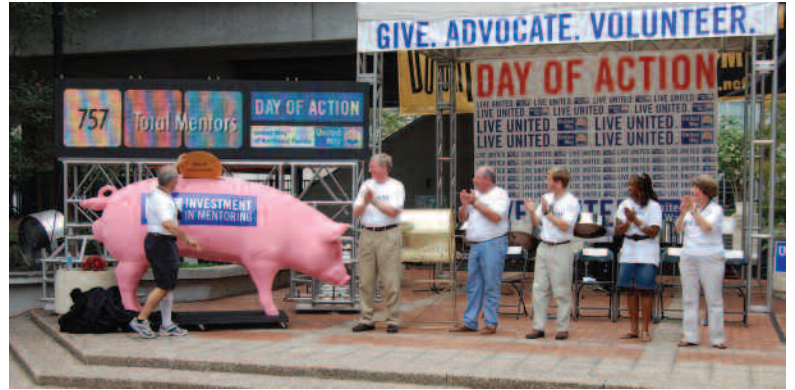
Day of Action Champion companies drop "coins" into the Investment in Mentoring piggy bank, as the tally board behind it counts up the number of mentors.