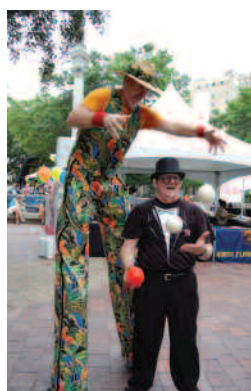
The Hemming Plaza festival featured performers such as jugglers and stilt-walkers.