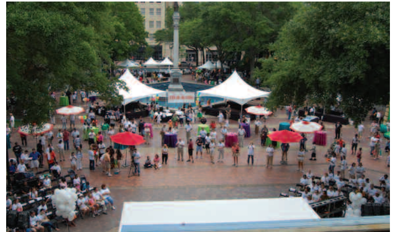
A bird's eye view of Hemming Plaza during Day of Action