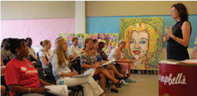
One of the mentor training sessions held in MOCA, Dalton Agency, and City Hall