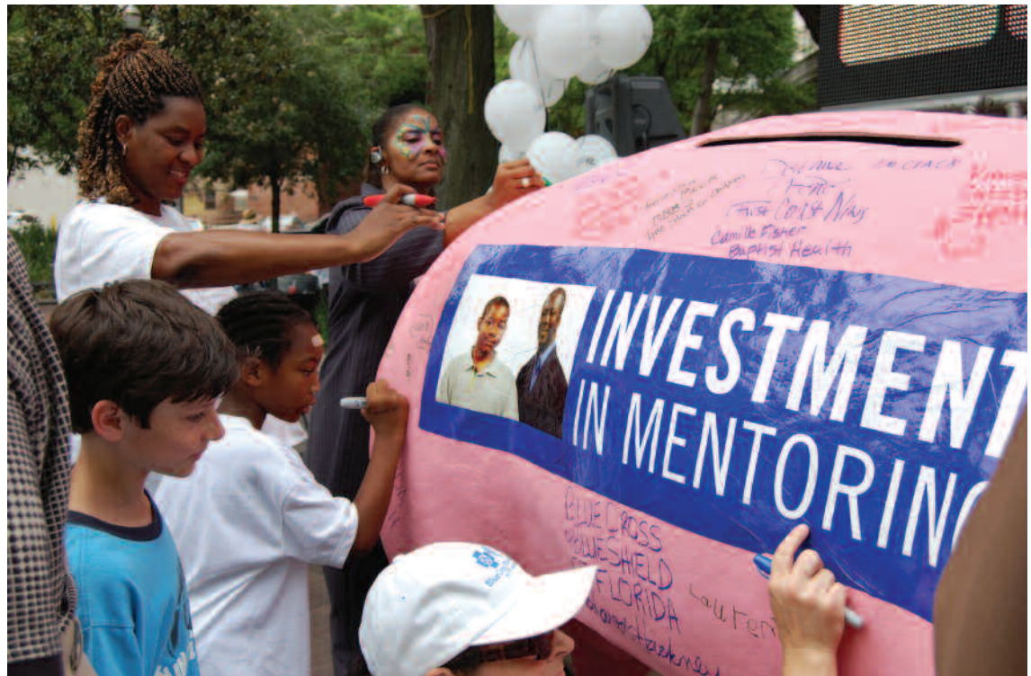
Festival attendees were encouraged to sign the Investment in Mentoring piggy bank