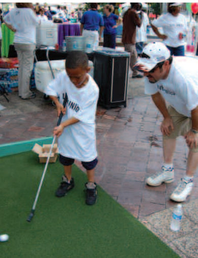
A shot-putt was one of the sports activities at the Hemming Plaza festival