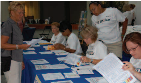
Future mentors register for their training sessions.