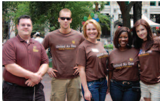
Employees from UPS show their support during Day of Action