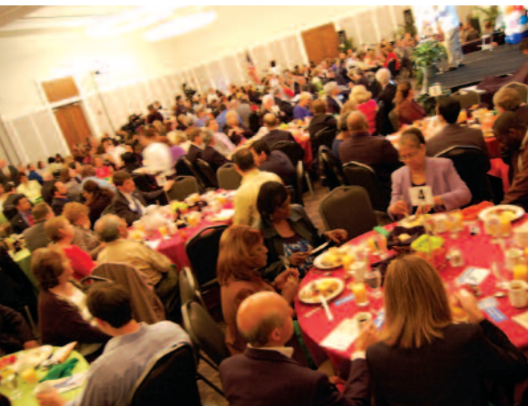
The Campaign and Leadership Recognition Event guests enjoyed a breakfast prior to the program.