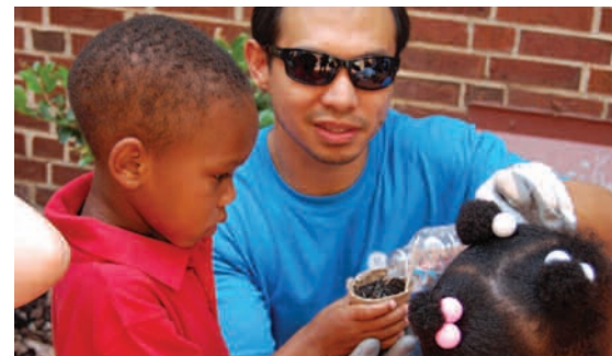
An employee shows preschool children how to grow seedlings

Five-hundred hands, plenty of sweat and scores of heartfelt smiles – all inspiring measures of the approximately 250 GE Aviation-Unison employees who spent the afternoon impacting the areas of education, income and health at a recent volunteer event.