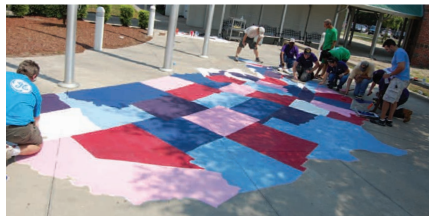
GE/Unison employees paint a United States mural at Saint Clair Evans Academy

forward to continuing the partnership we have with the United Way. I would encourage other local sites to consider volunteer-teambuilding events such as this one!” United Way coordinated with partner agencies and other United Way friends to organize activities among 10 locations including DLC Nurse & Learn, Community Connections of Jacksonville and Pine Castle, Inc. Companies interested in organizing a volunteer event for their employees may contact the Volunteer and Community Engagement office at www.uwnefl.org/groupvolunteering .